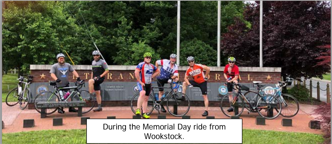
During the Memorial Day ride from Wookstock.